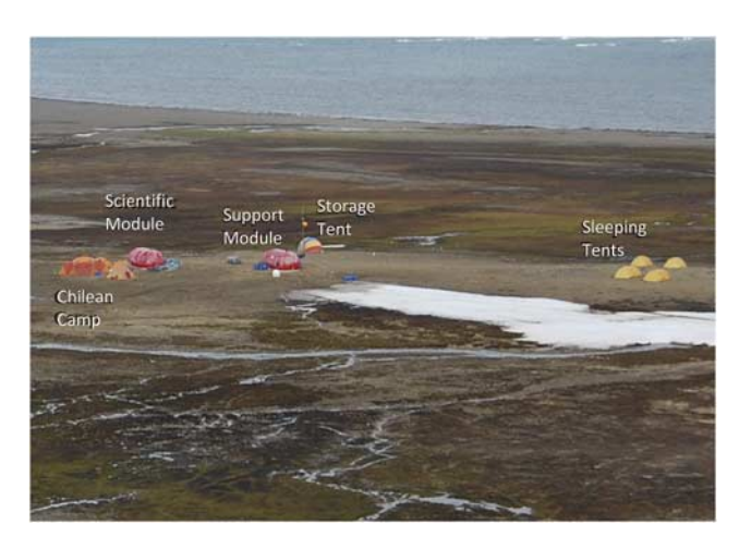
Fig. 1. View of the Spanish camp at South Beaches, Byers Peninsula. Picture taken on January 2010. Note that impacts associated with the Chilean camp are not included in this study.

sampling activities since the late 1940s and ice-free areas visited over much of the Antarctic Peninsula and beyond.